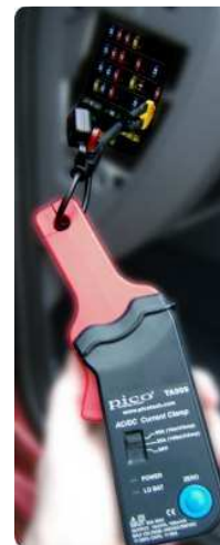
Photo Caption right: Pico Current Clamp and Fuse Extension Lead in use

The PP408 Fuse Extension Lead Set is available immediately, either direct from Pico Technology or from one of its authorised distributors, at £29.50 + VAT. Read further information on the Pico Technology website at www.picotech.com , or request details by calling +44 (0) 1480 396 395.